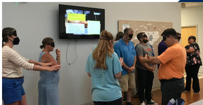
Professional Development for the Teachers